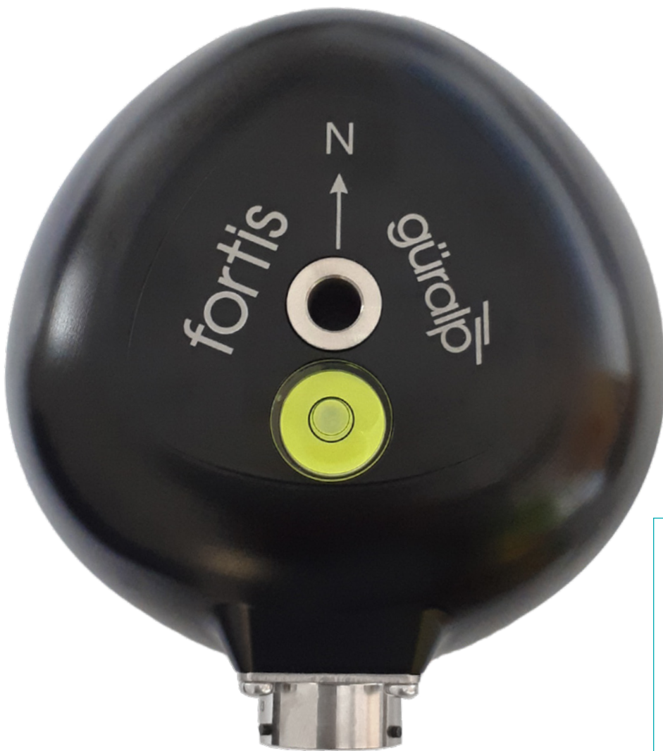
FORTIS AT ACTUAL SIZE (125 MM DIAMETER)

The Güralp Fortis is a strong motion analogue accelerometer with an innovative, slim-line design for fast installation in any environment.